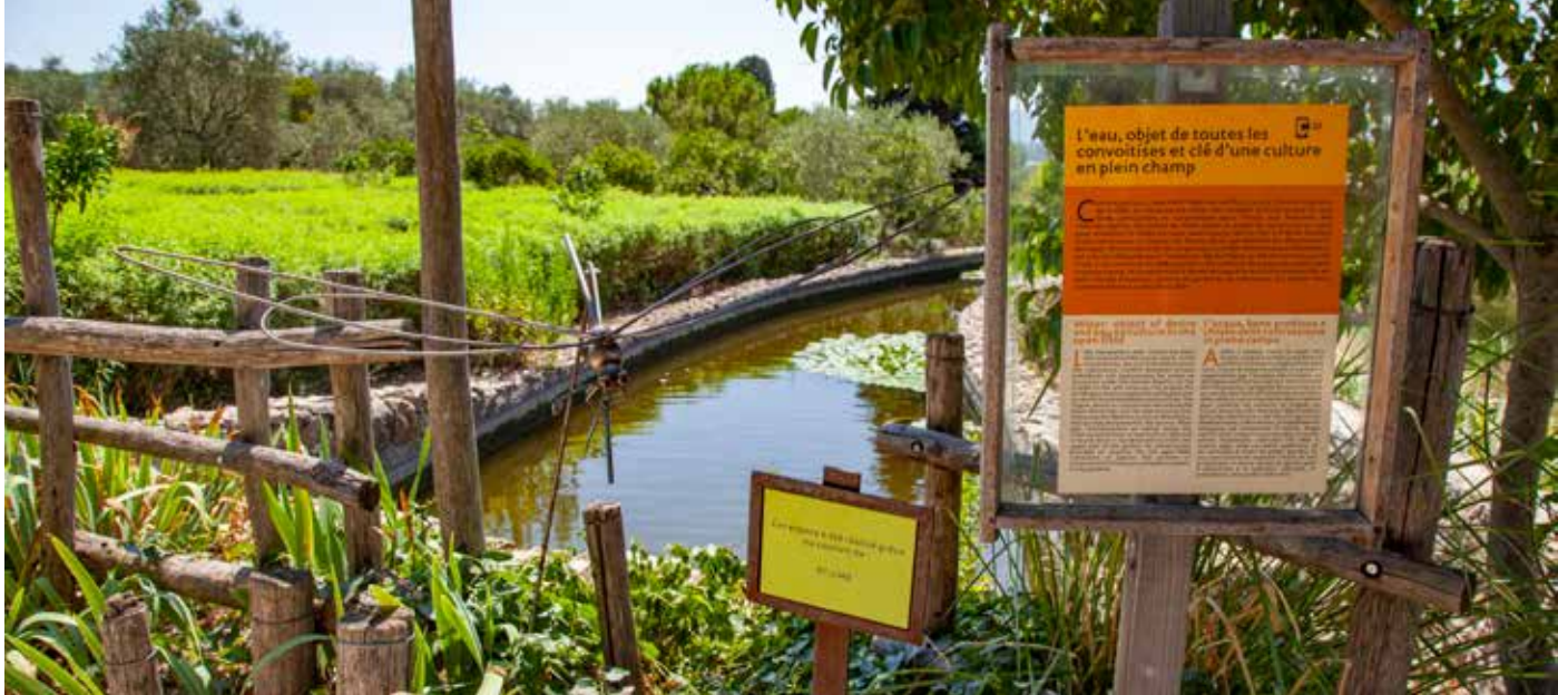
Water retention pond, the Gardens of the MIP

As part of the construction works on the Gardens, a pool was also established so that everyone could observe the fauna which would develop there.