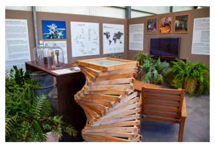
The greenhouse of the Gardens of the MIP

Gilles Sensini, the architect, commented: "The greenhouse forms a barrier which whets the visitor's curiosity. This allows us to stage the process of entering the gardens to make it like immersing oneself in an atmosphere conducive to a special experience. This barrier acts as a passage between the urban world and the landscape of the hills. Grafting a contemporary extension onto a traditional bastide is not simple, as the graft has to be accepted by the social body of the heritage it represents. The greenhouse recalls the agricultural culture of the region and engages easily with the local landscape" ».