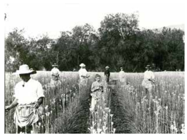
A tuberose harvest in the early 20th century, Grasse

For economic reasons related to wage costs and the globalisation of businesses, flower growing and the very presence of fields of scented flowers had almost disappeared from the Grasse area. It was, therefore, fundamental for the International Museum of Perfumery (MIP), through the Gardens of the MIP, to continue this tradition, registered in UNESCO's Cultural and Immaterial Heritage.