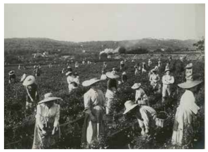
A jasmine harvest in the early 20th century, Grasse

Nowadays, these two countries supply in equal proportions 90% of world production.