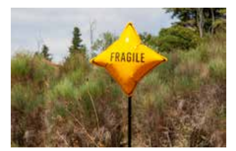
Free Figures, JMIP, 2019