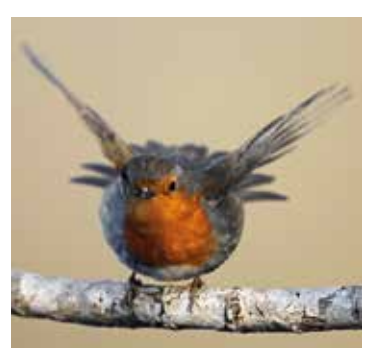
Robin