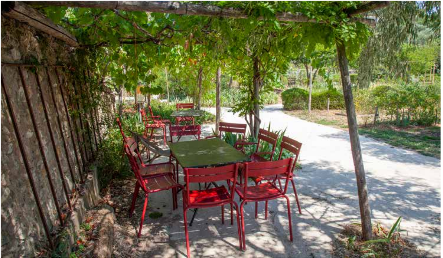
Pergola to the Gardens of the MIP

❖ The Pergola of the rosebushes: Made of metal and wickerwork, it references the harvesters' baskets.