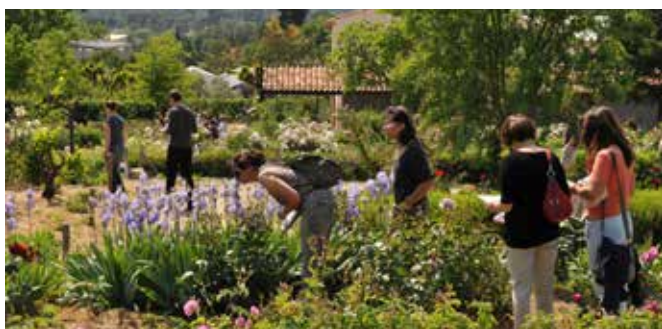
The Gardens of the MIP, Iris florentina in bloom

The “Bastide du Parfumeur” was brought into being with the aim of raising public awareness, at the most extensive scale, of the history of the growing of scented plants in the Pays de Grasse. This project, exclusively angled towards the various issues suffered by local agriculture, provided an essential place both to sustainability and the tangible and intangible heritage of the Pays de Grasse.