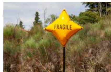
Free Figures, JMIP, 2019