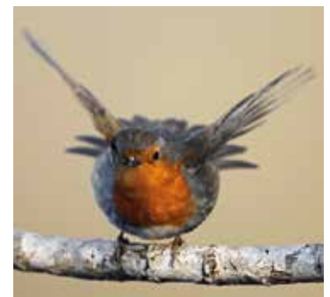
Robin

This is a commitment to use techniques which respect the environment, to practice organic gardening (no phytosanitary products – neither pesticides, nor synthetic fertilisers), to prune trees outside nesting season, to promote biodiversity by installing nest-boxes, hibernation shelters, making woodpiles, favouring native plants.