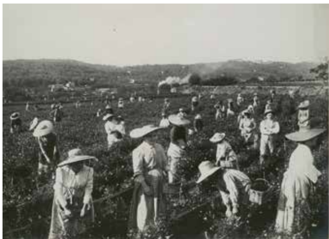
A jasmine harvest in the early 20th century, Grasse

Nowadays, these two countries supply in equal proportions 90% of world production.