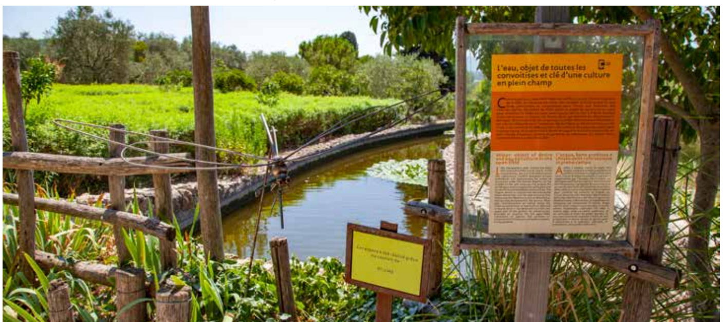
Water retention pond, the Gardens of the MIP

As part of the construction works on the Gardens, a pool was also established so that everyone could observe the fauna which would develop there.