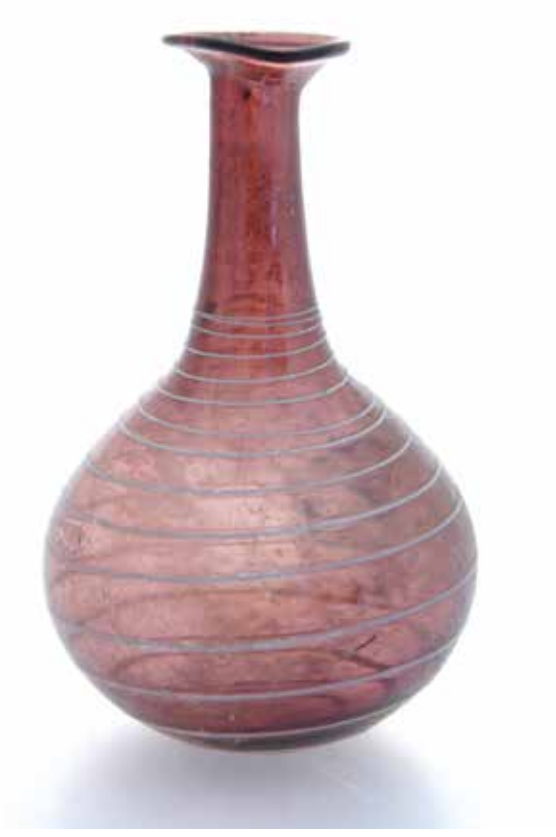
Piriform bottle - 2nd/3rd century BC - Syria - Blown glass

Under Julius Caesar, the body cult, with perfume serving as an essential accessory, reached its apex. In this polytheistic society, each divinity was even allocated their own fragrance. Rome may not have shown innovative flair in terms of creating new fragrances, but it popularised its use and revolutionised its transport and trade: lighter glass (blown or moulded) packaging was used for its air-tight qualities, dethroning earthenware as the go-to packaging.