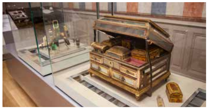
Grooming case – 18th century - Venice, wood, glass, carton, cloth, metal International Museum of Perfumery, inv. 94 48

Grasse wanted to be the first to found an International Museum of Perfumery, and the town put forward a well-researched scientific proposal, backed by a tenacious desire to see the project come to light.