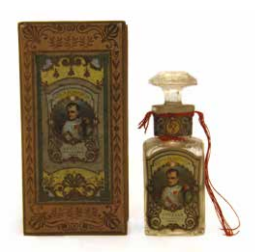
Étoile de Napoléon - Paris - Viville - 19th century

After a burgeoning trade in extravagant and elitist scents, the second half of the 20th century saw deep-rooted change: sales strategy in perfumery now targeted all social classes, resulting in sales prices being slashed, and costs decreasing as a result. Launch after launch followed suit, cashing in on this newfound popularity. Scent fashions and trends began rapid-cycling, stimulated by marketing and consumers hungry for new products. This thirst for newness had never felt as urgent. But for a handful of exceptions, perfumery shifted from the exceptional to the habitual, from an exclusive accessory to a mass-market product. Long neglected, scent became more popular than ever before, cropping up in food, household products, car air fresheners, offices and public spaces. And while a great many of these scents were designed to heighten pleasure, many were used to trigger desire and encourage buying.