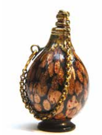
17th century Murano crystal bottle - Venice - silver-gilt base and stopper.

But the crusades and discovery of the New World ushered in a host of new raw materials. The powers of plants, spices and herbs were revered as proof of God's love in contrast to the stenches caused by the great epidemics of the times. In this golden age of mysticism and symbolism, plants were allocated therapeutic virtues based on their colours and shapes.