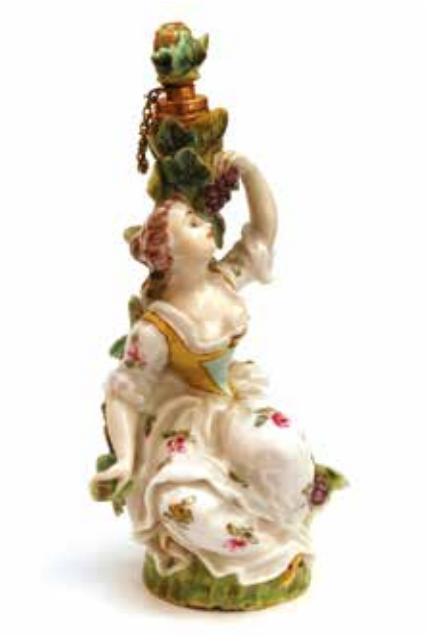
Figurine bottle in the shape of a young woman picking a bunch of grapes – Chelsea Porcelain - 18th century