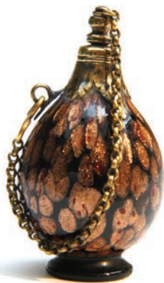
17th century Murano crystal bottle - Venice - silver-gilt base and stopper.

But the crusades and discovery of the New World ushered in a host of new raw materials. The powers of plants, spices and herbs were revered as proof of God's love in contrast to the stench caused by the great epidemics of the times. In this golden age of mysticism and symbolism, plants were allocated therapeutic virtues based on their colours and shapes.