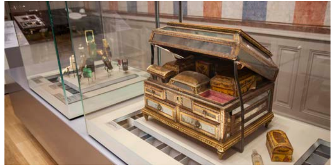
Grooming case - 18th century - Venice, wood, glass, carton, cloth, metal International Museum of Perfumery, Inv. 94 48

Grasse wanted to be the first to found an International Museum of Perfumery, and the town put forward a well-researched scientific proposal, backed by a tenacious desire to see the project come to light.