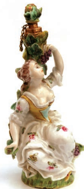
Figurine bottle in the shape of a young woman picking a bunch of grapes - Chelsea Porcelain - 18th century