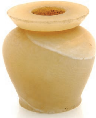
Ointment pot - Egypt, Middle Kingdom - Carved alabaster.

The word 'perfume' dates back millennia, taken from the Latin word perfumare , meaning 'by smoke', a necessary factor in its original use for sacred, medical, or ritual fumigations. From scents and perfume to fragrance: a story of sacredness and seduction.