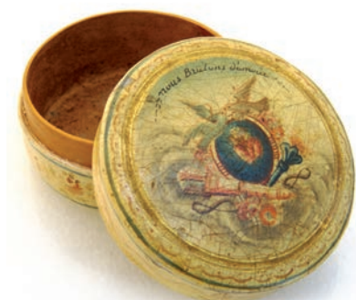
Bergamot box - Bergamot peel - France - wallpaper and varnish - 18th century