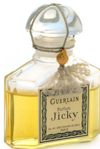
Jicky - Paris - Guerlain - 1889