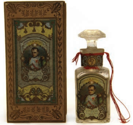
Étoile de Napoléon - Paris - Viville - 19th century

After a burgeoning trade in extravagant and elitist scents, the second half of the 20th century saw deep-rooted change: sales strategy in perfumery now targeted all social classes, resulting in sales prices being slashed, and costs decreasing as a result. Launch after launch followed suit, cashing in on this new-found popularity. Scent fashions and trends began rapid-cycling, stimulated by marketing and consumers hungry for new products. This thirst for newness had never felt as urgent. But for a handful of exceptions, perfumery shifted from the exceptional to the habitual, from an exclusive accessory to a mass-market product. Long neglected, scent became more popular than ever before, cropping up in food, household products, car air fresheners, offices and public spaces. And while a great many of these scents were designed to heighten pleasure, many were used to trigger desire and encourage buying.