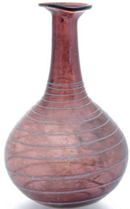
Piriform bottle - 2nd/3rd century BC - Syria - Blown glass

Under Julius Caesar, the body cult, with perfume serving as an essential accessory, reached its apex. In this polytheistic society, each divinity was even allocated their own fragrance. Rome may not have shown innovative flair in terms of creating new fragrances, but it popularised its use and revolutionised its transport and trade: lighter glass (blown or moulded) packaging was used for its air-tight qualities, dethroning earthenware as the go-to packaging.