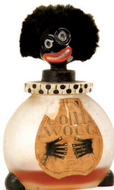
Golli Wogg bottle, Vigny - Glass - Franc

It also helps improve the museum's facilities in terms of lighting, purchasing furniture and technical equipment.