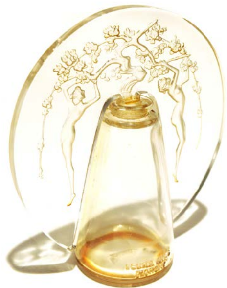
Leurs âmes - Paris - Lalique