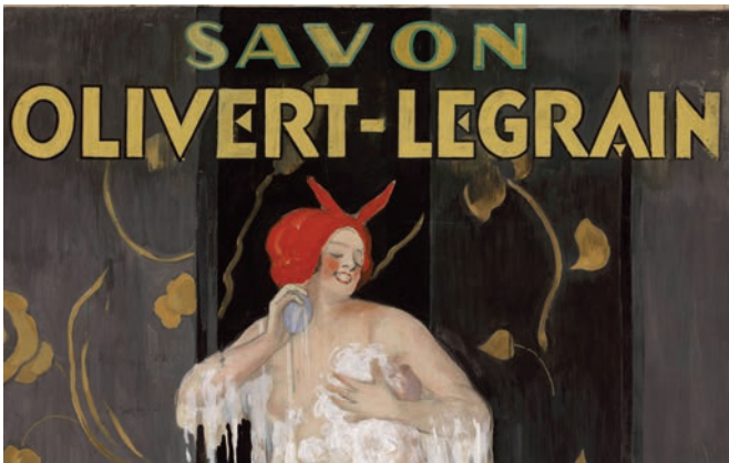
Olivert-Legrain soap poster - L. Capiello - 1920

And of course, perfume is the theme for many a private collection. But prior to the opening of the International Museum of Perfumery, no public establishment dedicated to safeguarding this heritage existed. Soap, make-up and cosmetics all fall under the remit of what we now consider to be perfumery, meaning luxury alcohol-based perfumery.